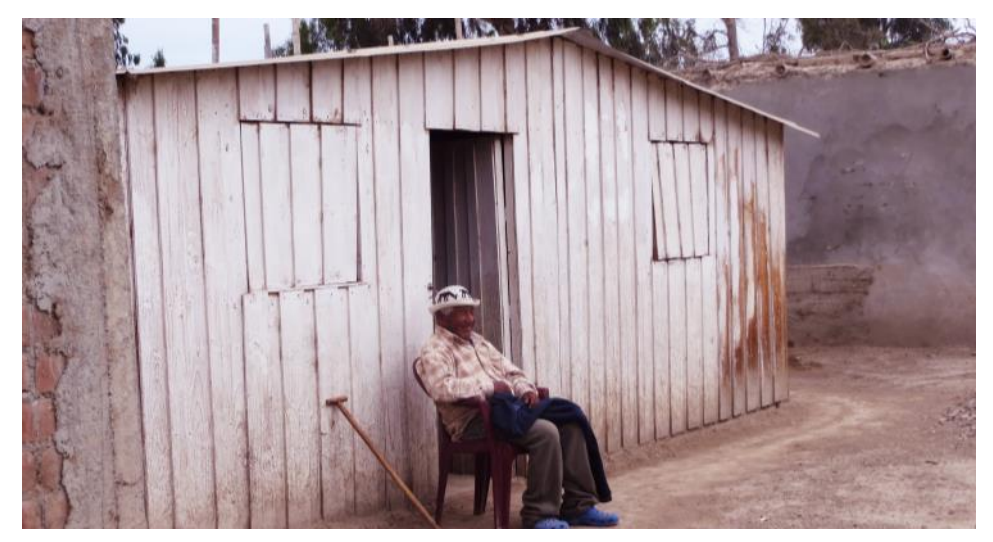
Figure 1. Non-modified transitional house in Peru after 5 years of use provided by TECHO. (Wagemann)

Case studies were analised in order to understand the process of recovery that families face after a disaster. The aim was to identify steps, similarities and differences in the process from temporary to permanent housing. Chile and Peru were selected based on the occurrence of a disaster with large impact in the past years; the use of the transitional shelter approach with the same mode in different climatic zones; and the differences on the type of land right situation (displaced and non-displaced communities).