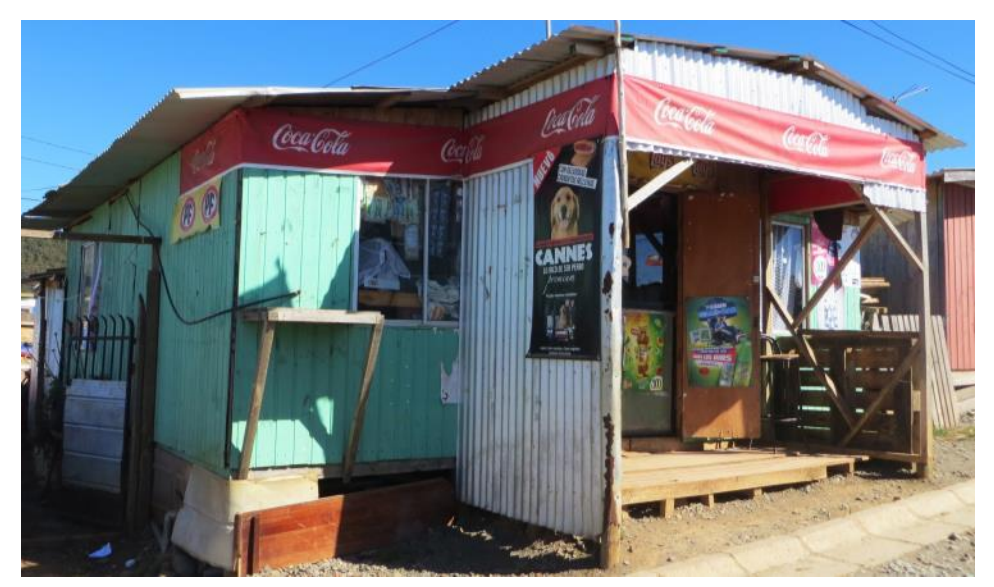
Figure 2. Example of a modified transitional house in Dichato, Chile, 2012. (Wagemann)

Three questions guided the study of the cases: 1) How families modify their temporary shelters and why they do it? 2) What are the characteristics of the process? And 3) what features are essential for supporting the process of transition? From field observation became clear that most transitional shelters were modified throughout the years, and therefore one of the challenges was to recognise the houses after years of use, in order to select the cases to compare (Figure 2). Because the cases where difficult to locate, the method used to find the houses was to visit the places in company of a representative of the government or the organisation that provided the shelters, to identify houses to study and members of the community that could collaborate in searching of a variety of different modified houses.