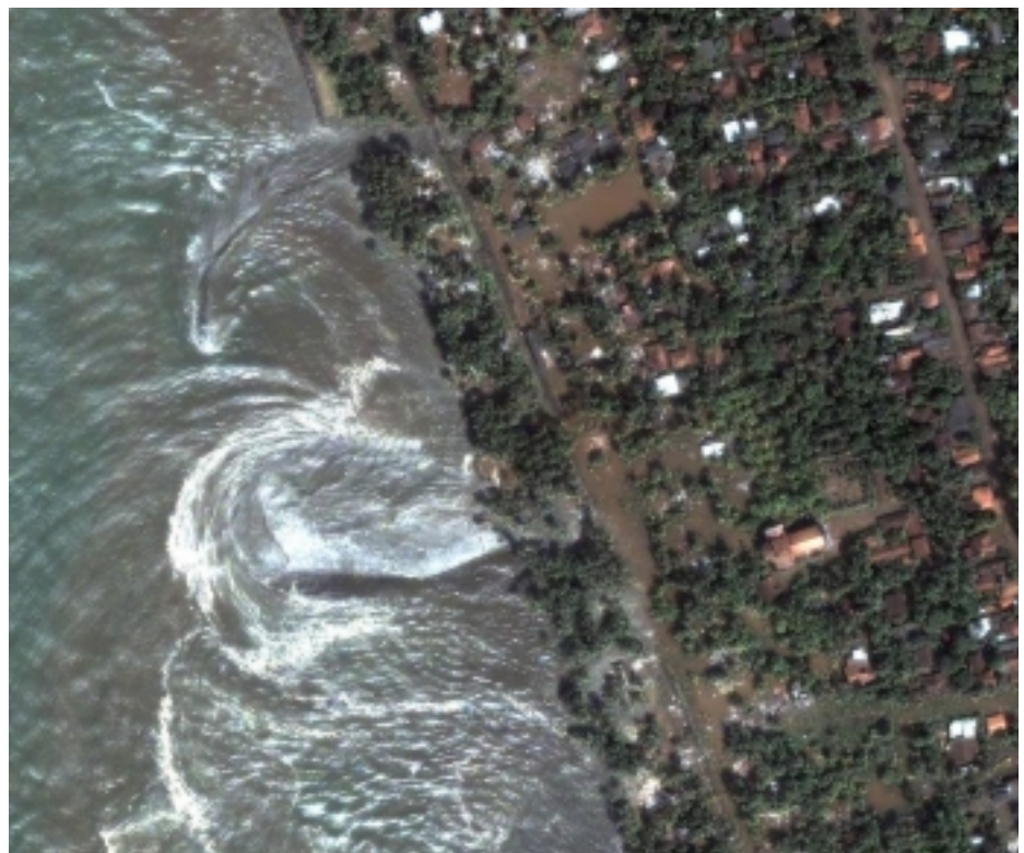
Kalutara, Sri Lanka, 26th December 2004: Receding waters from tsunami.