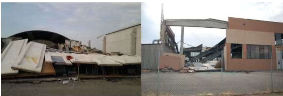
Figure 2: Damage to RC commercial and industrial facilities observed by the Author in Bologna after the Emilia-Romagna Earthquake of May 2012

A vulnerability function has a direct impact on the AEP and OEP curves. For instance the shape of the vulnerability function defines the shape of the EP curves as this represents the distribution of the hazard interaction with the vulnerability. Adjusting the vulnerability function's MDR therefore has a direct impact on the AAL as well as the return period loss affecting the reinsurance treaty cost calculations. As an example, doubling the vulnerability at all peak gusts will result in doubling AAL and approximately similar change in the EP curves. The aleatory variability has no impact on AAL. However, this could have a significant impact on the tail of the EP curves where an increase in variability will "fatten" the tail risk. Given the impact a vulnerability function has on the EP curves and the resulting risk metrics, it is important to understand the drivers of vulnerability. This allows a better insight into what forms a vulnerability function and hence the sensitive drivers of vulnerability that ultimately impacts the EP curves.