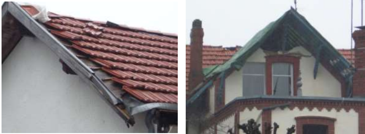
Figure 3: Typical damage modes observed in Europe extra-tropical cyclones from damage surveys by the Author in France after windstorm Klaus, Jan 2009

storm damage from European events of Emilia-Romagna Earthquake of May 2012 and windstorm Klaus in January 2009 respectively. What determines the resistance of a subject at risk to a particular hazard is adaptability to local hazard, legislation, architectural practice and deterioration.